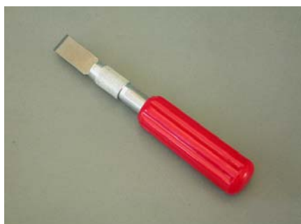
X-Acto Knife #4018