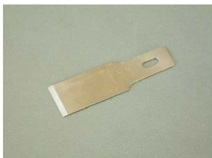
Replacement Blades #4023