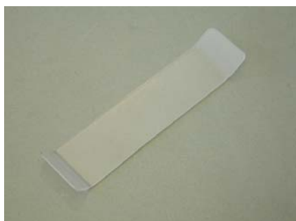
Pressure Pad #4610