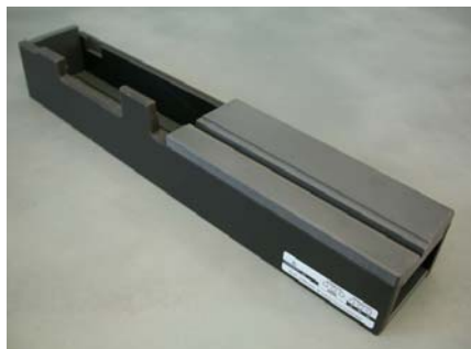
Insertion Jig #4606