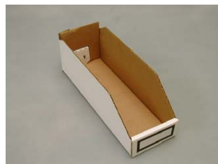
Storage Box #4055