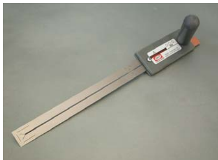
Insertion Tool #4602