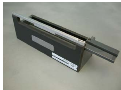
Cartridge Holder Jig #4608